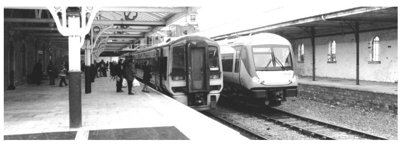
Not the current scene: Aberystwyth station: the press run of the 170 class, no longer being used on Cambrian lines.

Please note the times may change for meetings during the last six months of 2002 due to timetable changes. Any changes plus